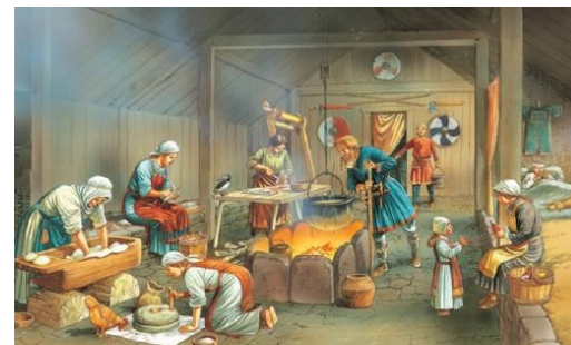
Inside a typical Viking longhouse